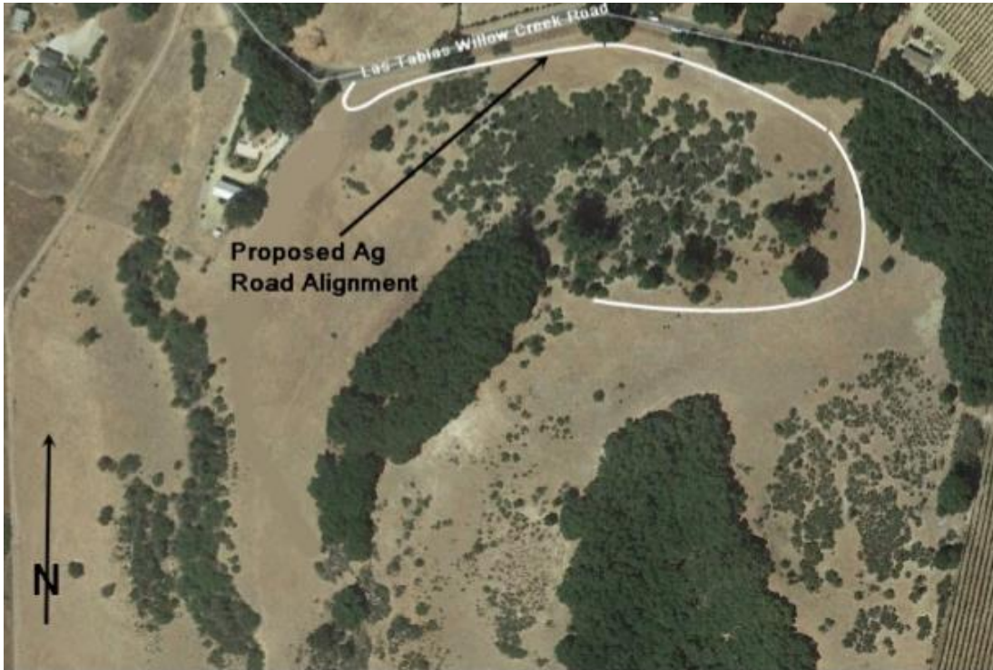
Map 1. Project Location