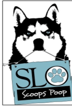
Advertising for the county campaign

The county of San Luis Obispo has a great pamphlet outlining the importance of collecting your dog's waste. Uncollected waste can wash into storm drains and flow into our lakes, streams, and the ocean without any treatment. Picking up and properly disposing of dog waste is safer for our health and for the health of our waterways.