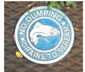
Example of a no dumping sign on a storm drain

Storm drains move water from streets directly to rivers and streams. Ensuring these drains are clear, allows them to work properly; removing water from streets, avoiding flooding, and keeping trash out of water ways. Never dump anything down storm drains and keep them clear of trash to keep pollutants out of waterways. If you see a clogged storm drain, report it to the Templeton Community Services District to alert them of the need for maintenance.